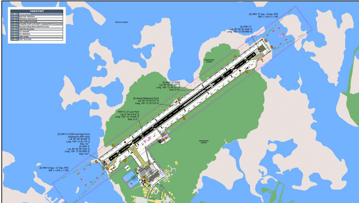
Table 5-9. Runway Protection Zone