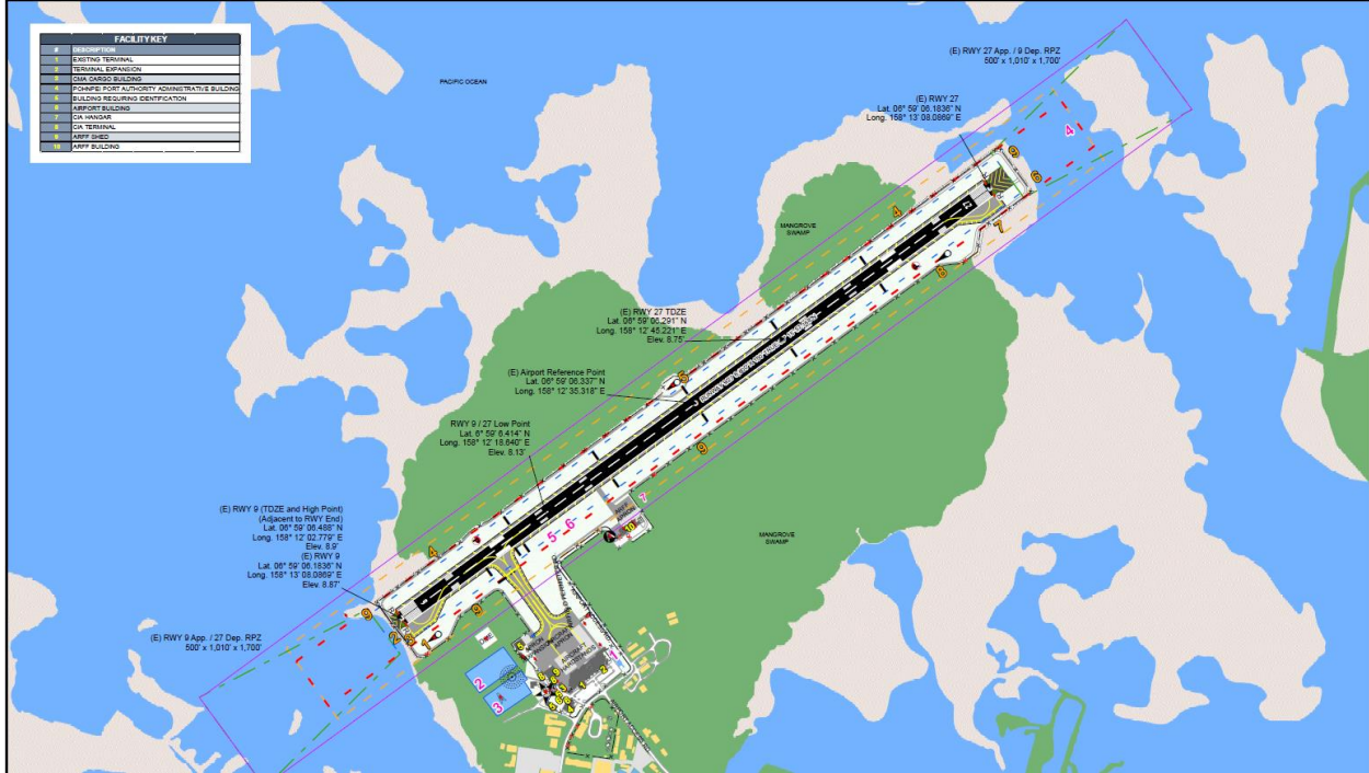
Table 5-9. Runway Protection Zone